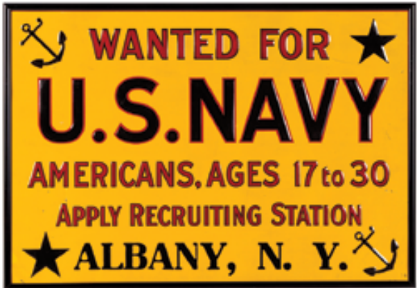
138. Navy Recruiting Station Sign

13.75 x 19.75" Scarce, early embossed tin litho sign from an Albany, NY U.S. Navy recruiting station. Clean, bright and very attractive (a strong C. 8/+ ) w/ only minor wear. Framed.