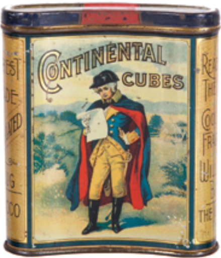
52. Continental Cubes Pocket Tin 3-7/8 x 3.25 x 1" Early tin litho concave vertical pocket tin w/ Washington images on both sides. Clean, bright and very attractive (displays as C. 8/+), w/ minor background wear. Min. bid $100.