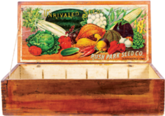
50. Rush Park Seeds Display Box 14.5 x 21 x 9.75" as shown lid up (5.5 x 20.75 x 9.75" lid closed) Large, early wooden store display box for Rush Park Seed Co. (Independence, IA). Label is clean, bright and excellent, w/ a little non-offensive minor wear and slight staining at outer border area (C. 8/+).