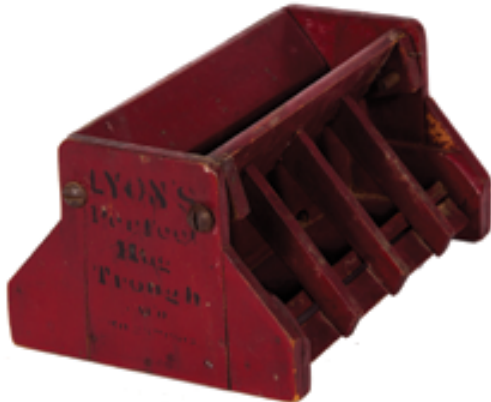
60. Salesman's Sample Hog Feeder

3.25 x 6.5 x 3.5" Early, miniature wooden working salesman's sample for Lyon's Perfect Hog Troughs (gates lift up at sides) w/ a rich, early paint surface and stenciled advertising at both ends. Excellent and all original, w/ nice surface patina and just the right amount of minor wear (C. 8+/-).