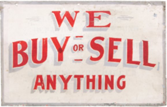
116. We Buy or Sell Anything Sign 11-5/8 x 18.25" Nice, early 2-sided hand-painted metal sign w/ strong colors and a rich, gently weathered natural patina to its nicely aged surface, w/ some lightly scattered general wear from use. Impressive looking piece, w/ a great primitive, country folk art look (C. 8/-). Min. bid $100.