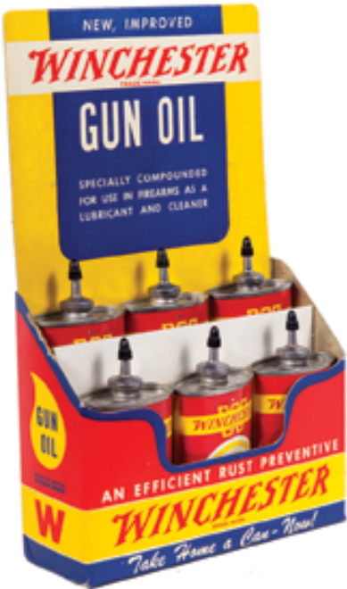
141. Winchester Gun Oil Display

11.25 x 7 x 2.5" Early cardboard countertop store display for Winchester Gun Oil, complete w/ all six of its full never used tins. Clean and like new (near mint).