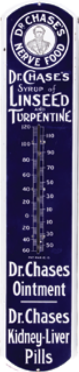
100. Dr. Chase's Porcelain Thermometer

39 x 8-1/8" Large, very early, heavy enameled porcelain quack medicine thermometer. Crispy piece is clean, bright and exceptionally nice (a strong C. 8.5++) w/ exception of minor wear in outer white border. Missing thermometer tube.