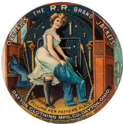
24. Dayton Overalls Mirror 2-1/8" (dia.) Outstanding, early celluloid advertising pocket mirror for Dayton Clothing Co.'s "R.R." brand overalls and cover-all jackets, w/ stunning multicolor graphics. Clean, bright and like new. Min. bid $100.