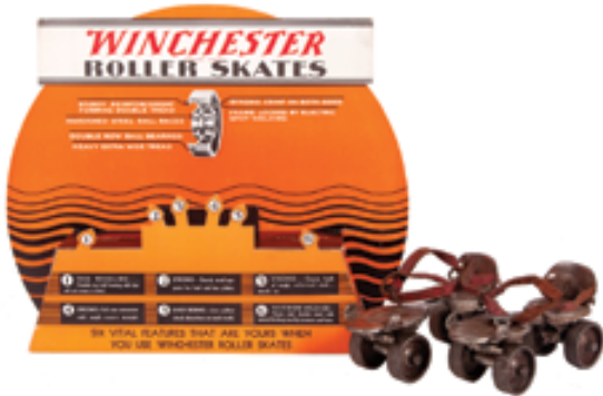
18. Winchester Roller Skates Display 17-7/8 x 21.75" Die-cut cardboard store display. Excellent overall (C. 8++) w/ non-detracting faint bend marks and tape reinforcement on backside. Includes a pair of early Winchester skates. Min. bid $100.