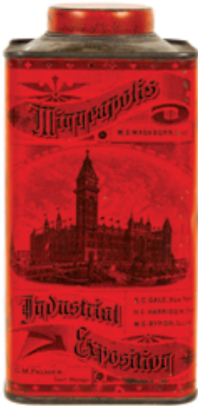
67. Minneapolis Industrial Expo Coffee

7.25 x 3-5/8 x 3-5/8" Very early 1 lb. can, a souvenir from Minneapolis Industrial Expo by Somers Bros. lithographers (different industrial images on each side). Has strong colors and displays nicely (C. 8+/-) w/ minor denting and a few small scattered scratches and wear spots.