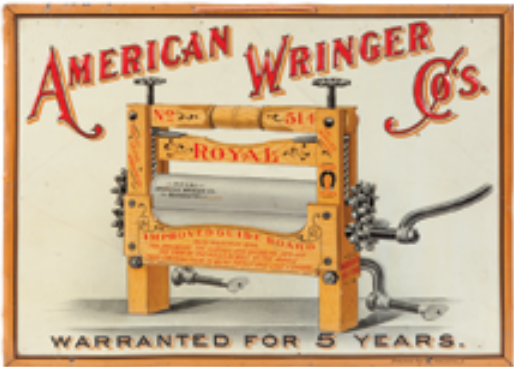
144. American Wringer Co. Sign

9.75 x 13-5/8" Early embossed self-framed tin litho, w/ stunning multicolor graphics. Clean, bright & excellent (a strong C. 8++), w/ non-detracting minor bends and edge wear.