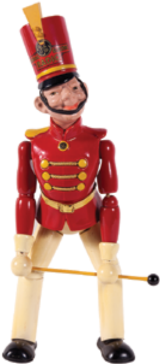
51. General Electric Adv. Figure 19" (tall) Outstanding wooden and composition jointed advertising figure. Paint and decals are crisp and like new (basically a strong C. 8.5++) w/ exception of small, typical minor crack mark at bottom side edge of coat (elastic cord attaching arms is a bit stretched and could use tightening or re-stringing). Design attributed to illustrator Maxfield Parrish. Min. bid $100.