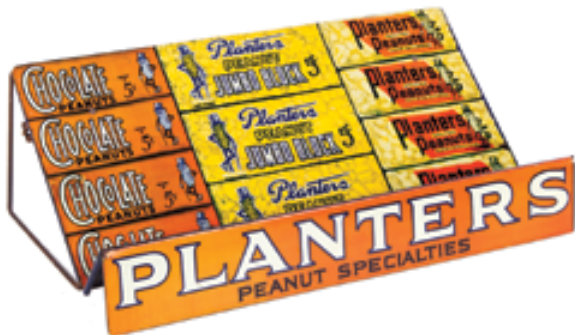
26. Planters Display Rack 8.5 x 14 x 2.5" (depth) Early tin litho Planters Peanut Co. "Z" shaped counter top display rack. Clean, bright and very attractive (basically a C. 8.5) w/ only minor wear. Min. bid $100.