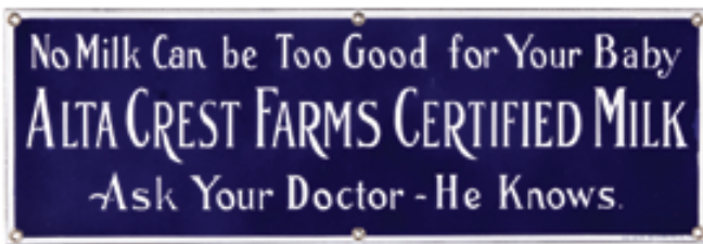
23. Alta Crest Farms Milk Sign 6 x 18" Early enameled porcelain sign for Alta Crest Farms brand milk. Crisp, bright and like new w/ ING-RICH stamping at bottom. Min. bid $100.