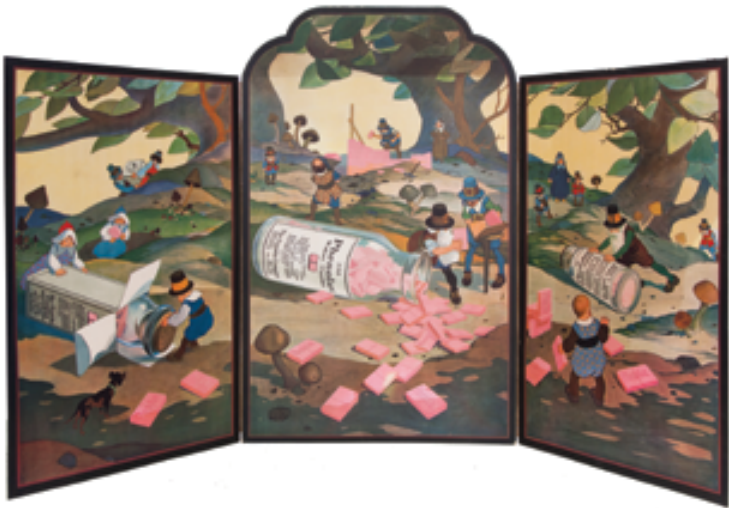
99. Upjohn Drugstore Window Display

32 x 43" (large piece as shown) Early 3-ps. cardboard die-cut medicinal window display. Clean, bright and very attractive, as found never used in its original mailing box (basically a strong C. 8.5) w/ exception of a little age tone soiling/darkening across top 5" center section of large piece. Lot also includes additional sign and display boxes.