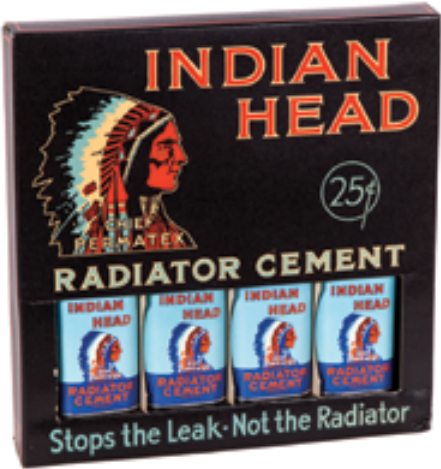
146. Indian Head Radiator Cement Display

11.25 x 11 x 1.25" Early cardboard store display complete w/ its full product cans. Bright and like new, w/ minor pinching and small tear mark on front.