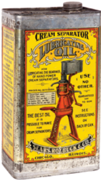
107. Sears Cream Separator Oil Can

11 x 6 x 3.75" Very early hand-soldered tin litho can for Sears, Roebuck & Co.'s cream separator lubricating oil, featuring beautiful graphic image of a fancy separator machine. Clean, bright and very attractive appearance (displays as a strong C. 8/+), w/ a little non-offensive scattered wear in bottom background area (critical grade C. 8/-).