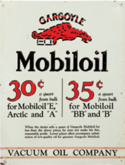
147. Gargoyle Motor Oils Sign

17.75 x 13.75" Early embossed tin litho sign. Clean, bright and displays very nicely (as a strong C. 8++) w/ a few traces of original protective paper on raised letters. Close examination will show a little non-offensive light wear and minor wrinkling at outer border edges (critical grade C. 8/-).