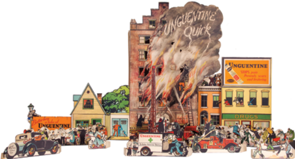
64. Unguentine Drugstore Display

69 x 39.75" Large ca. 1932 multi-piece cardboard drugstore window display for Co.'s burn ointment. Clean and very attractive (a strong C. 8/+ overall) w/ some light expected scattered wear.