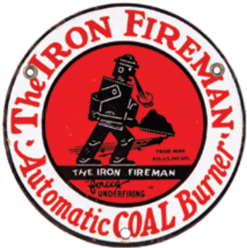
98. Miniature Porcelain Iron Fireman Sign

6" (dia.) Scarce, miniature variation heavy enameled porcelain sign featuring Co.'s Roboman logo. Clean, bright and exceptionally nice, w/ beautiful rich surface patina. Excellent (C. 8.5++).