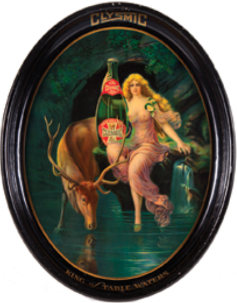
73. Clysmic Mineral Waters Tray

16 x 12-5/8" Early tin litho tray for Clysmic table waters, featuring stunning, multicol- or graphic image of large buck and topless girl (nice rack). Image area is clean, bright and beautiful (a very strong C. 8++), w/ a little light edge chipping in outer black rim area.