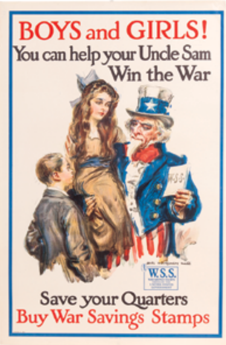
137. WW I War Stamps Poster

30 x 20" Vintage ca. 1917 WWI fund raising poster for War Savings Stamps, w/ great patriotic image by illustrator James Montgomery Flagg. Bright and very attractive appearance (basically like new), w/ exception of a little non-offensive minor wrinkling at top corners in outer margin area (note: printing was slightly off registration when created).