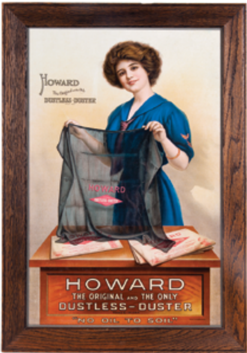
45. Howard Dusters Sign 29.5 x 20.5" (25-3/8 x 16-3/8" visible) Early paper litho sign for Howard brand dusting cloths (W.F. Powers Co. NY Litho). Clean, bright and displays as like new, although there is a little non-offensive minor hazy speckling evident if tipped in light just right (stated for accuracy, so minor barely merits mention). Nicely framed. Min. bid $100.