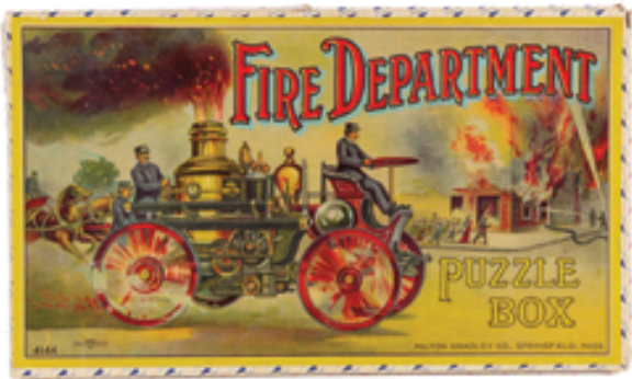
102. Fire Fighting Puzzles

9.5 x 16.25 x 1/2" Early boxed set of three different fire fighting puzzles by Milton Bradley Co. Both puzzles and box are clean and excellent (C. 8.5+), w/ a couple small tears on side edges of box.