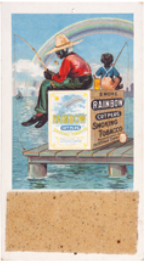
153. Rainbow Tobacco Match Scratcher

7-1/8 x 3-7/8" Very early cardboard match scratcher advertising B. Houde Co.'s Rainbow Cut Plug tobacco. Clean, bright and excellent (C. 8.5/+). Canadian.