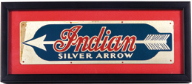
53. Indian Silver Arrow Outboard Motor Sign 3-3/8 x 11-7/8" sign (frame: 6.25 x 14.75") Scarce, vintage 1930 metal sign for Indian Motorcycle Co.'s "Silver Arrow" outboard boat motors. Clean and excellent (appears never used) w/ some trace remnants of original protective paper at outer border edges. Framed. Min. bid $100.