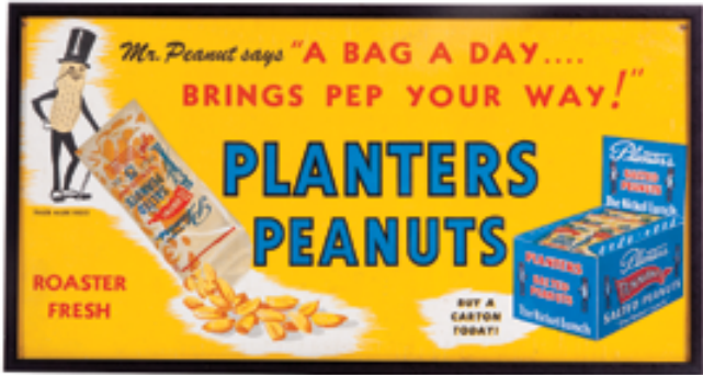
69. Planters Trolley Car Sign

11.25 x 21-1/8" (10-3/8 x 20-3/8" visible) Scarce, ca. 1930's cardboard trolley car sign. Clean, bright and very attractive (displays as a strong C. 8/+) w/ a couple small nail holes at top corners and some non-offensive minor wrinkling and soiling at upper edge. Framed.