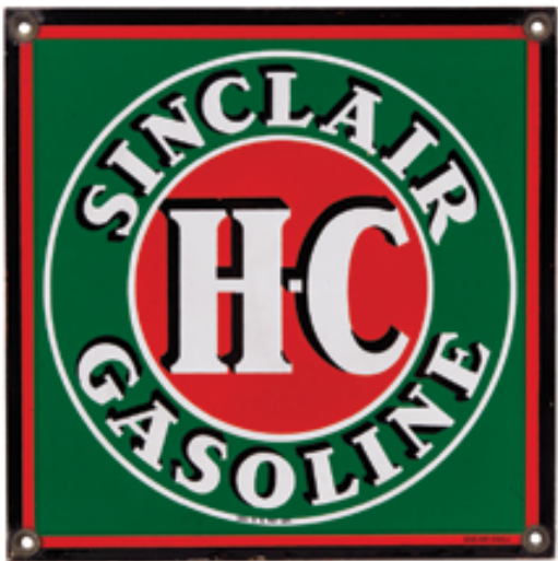
90. Porcelain Sinclair Gasoline Sign

14 x 14" Very early, heavy enameled porcelain sign for Sinclair H-C Gasoline. Has vibrant, bright colors and nice original sheen (basically crisp and like new) w/ exception of a little minor edge wear and slight soiling.