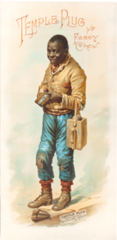
76. Temple Plug Tobacco Sign

28 x 14" Nice, early paper litho linen backed sign from Wellman & Dwire Tobacco Co. (Quincy, IL). Clean and very attractive (displays as a strong C. 8++), w/ some extremely well done professional restoration in outer background area.