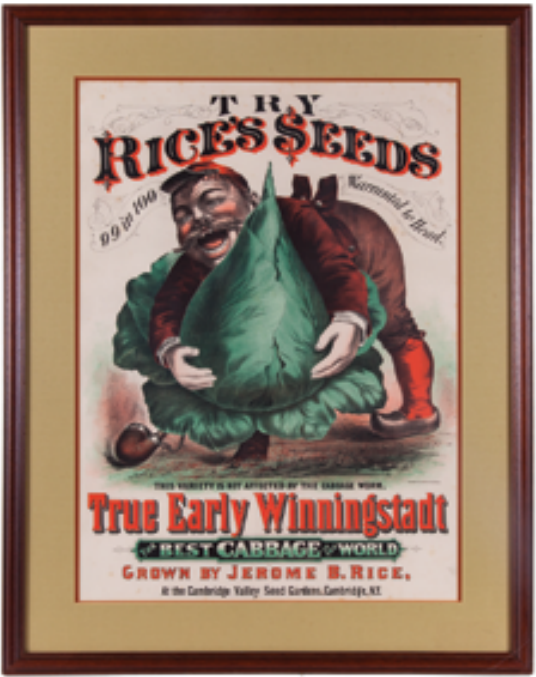
156. Rice's Seed Co. Sign

34.5 x 27.5" (27 x 19.75" visible) Large, very early paper litho sign for Rice's Cabbage Seeds. Clean, bright and very attractive (displays as a strong C. 8++) w/ a little faint, non-offensive minor toning/speckling in top background area. Nicely matted and framed .