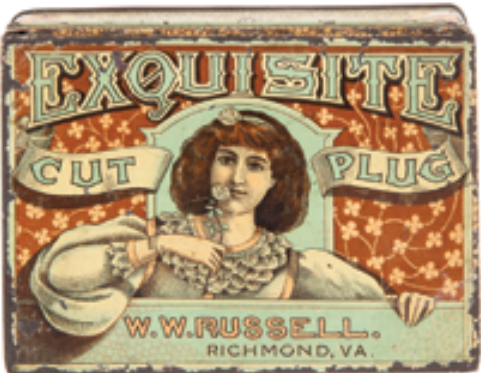
148. Exquisite Square Corner Tobacco

4.5 x 3-3/8 x 1-3/8" (h) Scarce, very early tin litho square corner tin (W.W. Russell Co.). Clean and very attractive (displays as a strong C. 8/+) w/ a little light scattered wear.