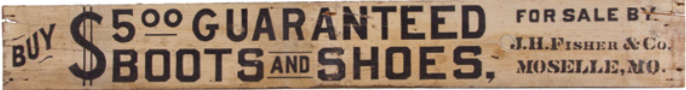
94. Folk Boots & Shoes Sign

5.5 x 42 x 3/8" Very early wooden painted county store sign. w/ a nice, all original dry paint surface. Has some light, scattered general expected wear, giving it a nice primitive country look (C. 7.5+/8-).