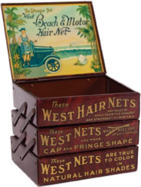
152. Beach & Motor Hair Nets Display

10 x 6 x 5-1/8" Early tin litho display for West brand hair nets, w/ beautiful color graphic auto scene inside the lift-up lid w/ three stacking fold-out product compartments underneath. Clean and excellent (C. 8.5/+).