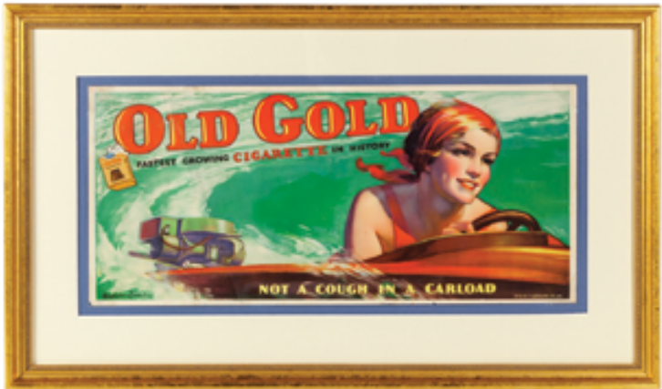
135. Old Gold Cigarettes Sign

16 x 27" (9-1/8 x 20-1/8" image) Ca. 1930's paper litho by illustrator Bradshaw Crandell. Clean, bright and very attractive (a strong C. 8+ appearance) w/ some non-offensive minor creasing and small edge tear in upper border area (critical grade C. 8/-). Framed.