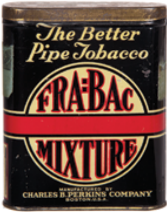
42. Fra-Bac Mixture Pocket Tin 4-3/8 x 3-3/8 x 1" Scarce tin litho vertical pocket tin. Clean, bright and very attractive (C. 8/+) w/ a little light background wear.