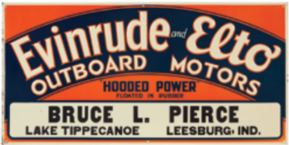
49. Evinrude Outboard Motors Sign 11.75 x 23.75" Early, embossed tin litho dealer sign for Evinrude and Elto brand outboard boat motors. Clean, bright and like new (near mint), w/ exception of a slight bit of oxidized storage wear at left border edge. Min. bid $100.