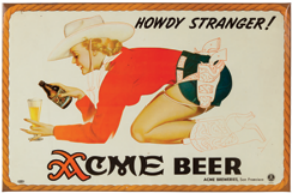
139. Acme Beer Sign (Petty Girl)

11.25 x 17-1/8" Early, beveled tin over cardboard sign for Acme Breweries (San Francisco, CA) w/ image by illustrator George Petty. Clean, bright and excellent (a strong C. 8++), w/ minor edge wear).