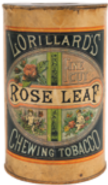
55. Rose Leaf Tobacco Store Bin

13-7/8 x 9" (dia.) Large, early, heavy cardboard w/ stone litho label. Displays nicely (C. 8+/-) w/ minor toning and wear and 1-3/8" tear at top edge of backside (some edge wear and early writing on wooden lid).