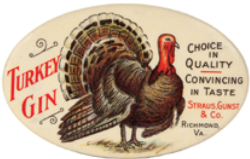
89. Turkey Gin Pocket Mirror

1.75 x 2.75" Scarce, early celluloid advertising pocket mirror for Turkey Gin (Straus, Gunst & Co., Richmond, VA). Clean, bright and like new.