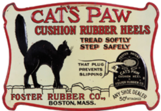
19. Cat's Paw Heels Sign 9 x 13.25" Early embossed tin litho sign featuring great image of Co.'s trademark black cat. Clean, bright and excellent (a strong C. 8++) w/ a little light scattered wear in raised outer border area. Min. bid $100.