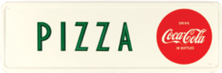
71. Coca-Cola Pizza Sign

16 x 50.25" Large, ca. 1950's self-framed Coca-Cola Pizza sign. Never used piece is bright and excellent, w/ a little minor storage wear in outer raised border area (C. 8.5++).