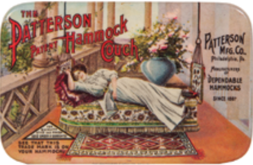
114. Patterson's Hammocks Pocket Mirror 1.75 x 2.75" Scarce, early celluloid (Patterson Mfg. Co. (Phil., PA). Excellent, w/ fancy embossed metal trim on backside. Min. bid $100.