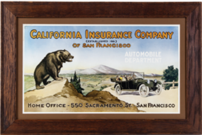
142. California Auto Insurance Sign

16-3/8 x 24-5/8" (10-5/8 x 18-7/8" image) Scarce, early paper litho auto insurance sign, w/ great early motoring image. Clean and very attractive (a strong C. 8++) in period frame.