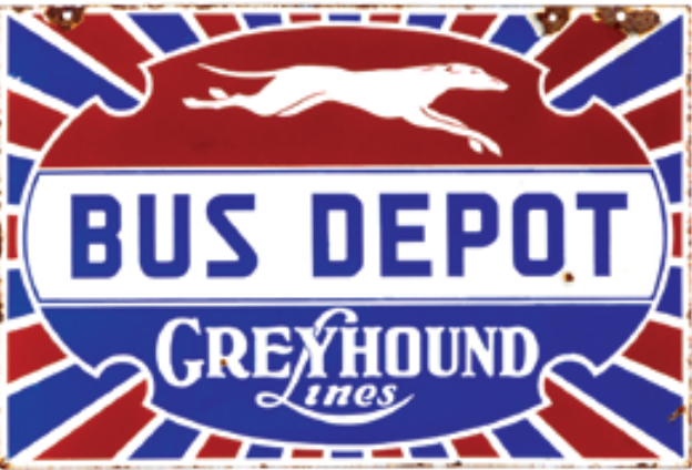
74. Greyhound Lines Bus Sign

20 x 30" Scarce, very early, 2-sided heavy enameled porcelain sign. Strong colors and original sheen (basically displays as a strong C. 8/+) w/ excep- tion of some weathered chips.