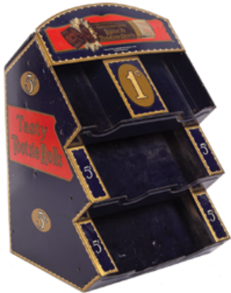
21. Tootsie Rolls Store Display 14 x 8.75 x 7.75" Tin litho countertop store display stand for Tootsie Rolls candies, w/ compartments for holding Co.'s 1¢ and 5¢ candies. Clean, bright and very attractive w/ only minor wear (a strong C. 8+). Min. bid $100.