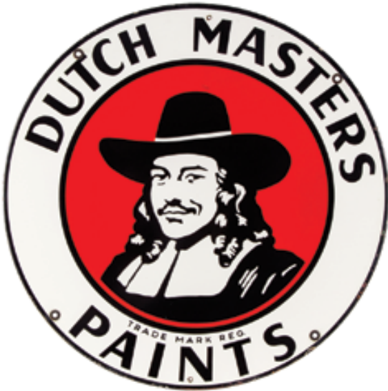
63. Dutch Masters Porcelain Sign

26" (dia.) Nice, early, heavy enameled porcelain sign w/ strong colors and great look. Clean, bright and excellent overall (a strong C. 8++) w/ a little light scattered edge wear.