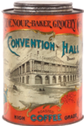
104. Convention Hall Coffee

6.25 x 4-3/8" (dia.) Scarce, very early tin litho 1 lb. Ridenour-Baker Grocery Co., (Kansas City) small top can, w/ nice image of Convention Hall building. Clean, bright and very attractive (a very strong C. 8++).