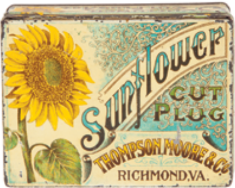
65. Sunflower Tobacco Tin

4-3/8 x 3-3/8 x 1-3/8" (h) Scarce, very early square corner tobacco. Clean, bright and attractive (displays as a strong C. 8++) w/ a little non-offensive minor background wear.