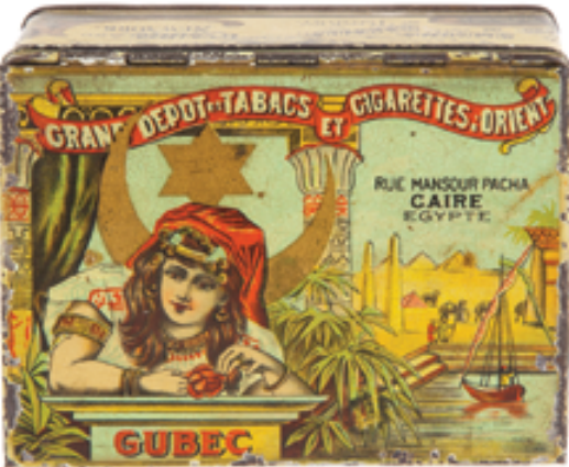
119. Gubec Square Corner Tobacco Tin 4-7/8 x 3-3/8 x 2.25" (h) Extremely rare, early tin litho square corner tobacco tin (Imperial Turkish Tobacco Co., New York). Clean, bright and very attractive (basically a strong C. 8/+ ) w/ some non-offensive early edge wear. Min. bid $100.