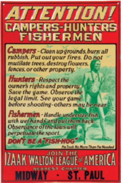
118. Conservation League Sign 17-5/8 x 11.75" Early embossed tin litho Sportsman's Conservation sign by American Art Works. Has bright colors, original sheen and displays very nicely (basically as a C. 8.5/+) w/ a few faint traces of very minor bending and small wear mark at outer right edge. Min. bid $100.