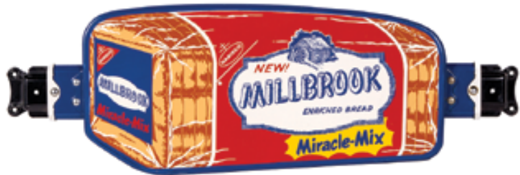
30. Millbrook Bread Door Push 8.5 x 26.5" Early, heavy, high quality metal country store screen door push, complete w/ its adjustable mounting bracket (bracket push bar on backside embossed "Thanks Call Again"). Never used piece is clean, bright and like new, w/ only minor wear. Min. bid $100.