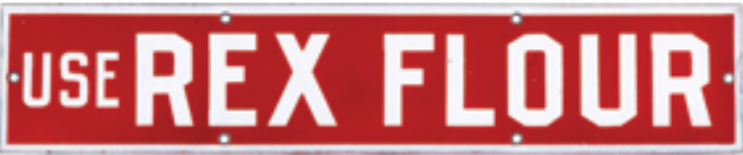
121. Rex Flour Porcelain Sign 4 x 20" Early, heavy enameled porcelain country store strip sign. Clean, bright and excellent, w/ rich surface patina. Min. bid $100.