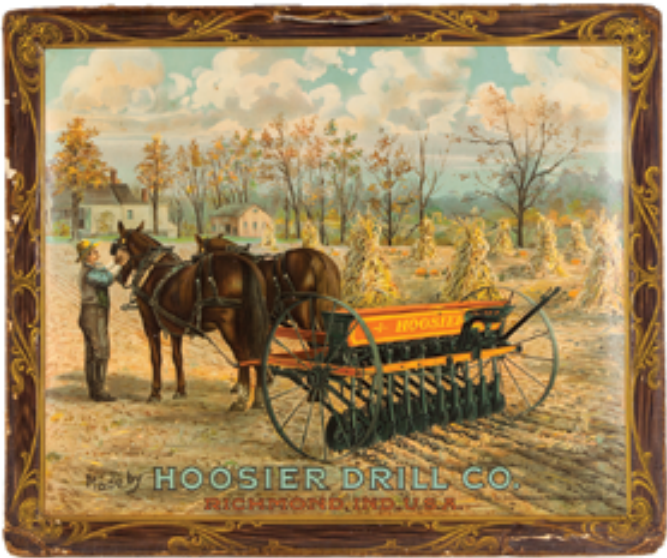
149. Hoosier Seed Drills Celluloid Sign

19-7/8 x 23-7/8" large, early celluloid (over cardboard) Ag Eqpt. sign. Image area is clean and excellent (a strong C. 8++) w/ some scattered wear and damage spots in its outer border area (could be easily hidden if framed).