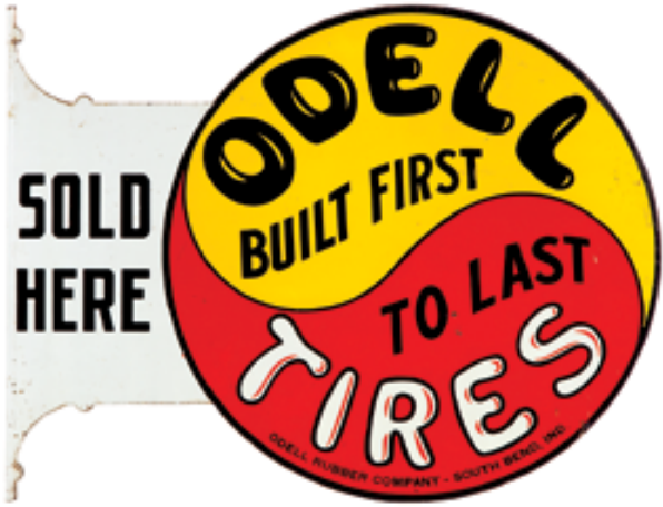
110. Odell Tires Sign

13-3/8 x 17-5/8" Scarce, early 2-sided tin litho flange tire sign from Odell Rubber Co. (South Bend, IN). Has strong colors and displays great, w/ some light scattered wear (C. 8+/-). Min. bid $100.