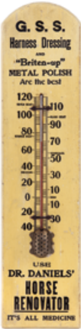
136. Large Dr. Daniels' Thermometer

24-1/4 x 6" Large, early wooden painted thermometer. Clean and very attractive, w/ rich patina to its paint surface (a strong C. 8/+ ) w/ a little non-offensive minor background and edge wear.