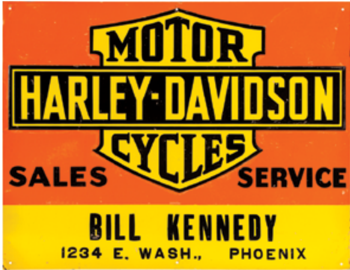
58. Harley-Davidson Sign

18 x 23.5" Impressive, ca. 1940's embossed tin litho motorcycle dealership sign. Clean, bright and excellent (C. 8.5/+), as found never used; t w/ a little minor crimping and storage wear at very outer edges and corners.