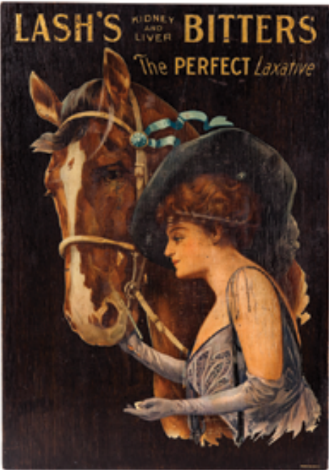
111. Lash's Bitters Medicine Sign 19-7/8 x 14" Very early wooden sign by Meyercord Co. for Lash's Bitters quack medicine product. Attractive and displays quite nicely w/ a little non-offensive light scattered wear (C. 8+/-). Min. bid $100.

13-3/8 x 17-5/8" Scarce, early 2-sided tin litho flange tire sign from Odell Rubber Co. (South Bend, IN). Has strong colors and displays great, w/ some light scattered wear (C. 8+/-). Min. bid $100.