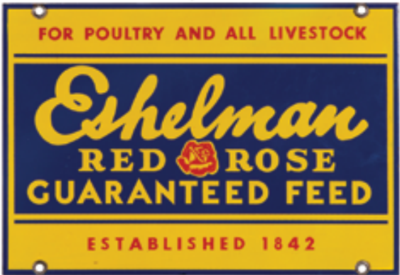
93. Porcelain Feed Sign

11 x 16" Early, heavy enameled porcelain feed store sign. Clean, bright and like new, w/ beautiful, original sheen.