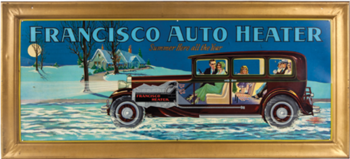
103. Francisco Auto Heaters Sign

18 x 40" Beautiful early, self-framed tin litho sign featuring stunning multicolor graphics. Clean, bright and exceptionally nice (basically displays as a C. 8.5+) w/ a few minor indents and wear marks in background area.