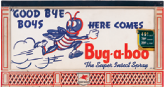
47. Socony Light-Up Display 8-5/8 x 16 x 4.75" Countertop shadow box style electric light up display for Socony-Vacuum Co.'s "Bug-a-Boo" insect spray. Front section is tin litho, w/ glass covered transparent advertisement featuring Co.'s great running bug character. Bright, clean and very attractive (a strong C. 8++), w/ a little cello tape staining on its updated pricing label. Min. bid $100.