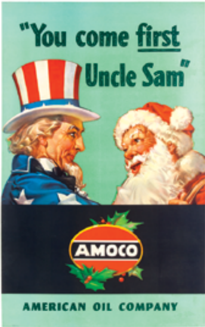
70. Patriotic Amoco Poster

42.5 x 26.5" Vintage 1940's large WW II era patriotic poster on heavy paper stock promoting American Oil Co.'s Amoco service stations. Clean, bright and excellent (displays as near mint), w/ exception of a 3" tear in outer left jacket area.