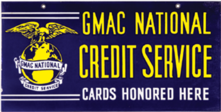
68. Porcelain General Motors Sign

12 x 24" Early, heavy enameled 2-sided porcelain sign for General Motors Co.'s credit services (same on both sides). Clean, bright and excellent (C. 8.5/+) w/ only minor wear.