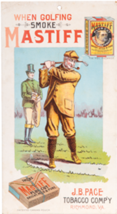
108. Mastiff Tobacco Sign

13 x 7" Very early cardboard litho golf theme sign. Clean, bright and attractive (basically displays as a solid C. 8/+); w/ a trace hint of minor soiling, a little non-offensive light creasing and some softening to reds in top letters.