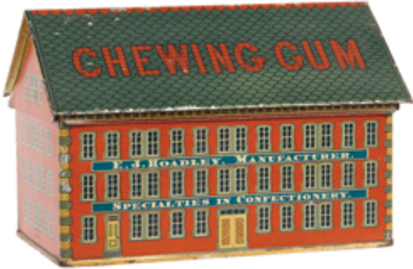
113. Hoadley's Chewing Gum Tin 4-1/8 (h) x 6-1/8 x 3-5/8" (at base) Extremely rare, early 2-ps. tin for E.J. Hoadley Confectionery Co.'s chewing gum, in shape of factory building. Clean, bright and very attractive (a strong C. 8++) w/ a little light scattered background wear. Min. bid $1,500.