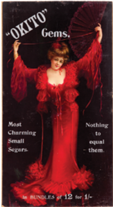
20. Okito Gems Cigar Sign 18.25 x 9-7/8" Beautiful, early, shiny finished cardboard litho sign for Okito brand cigars. Clean, bright and very attractive (a strong C. 8/+) w/ a little non-offensive minor scattered wear. Min. bid $100.