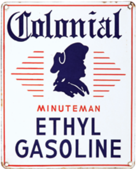
140. Colonial Gasoline Sign

15 x 12" Scarce, early enameled porcelain gas pump sign for Colonial Minute-man brand ethyl gasoline. Bright and attractive appearance, w/ some minor oxidized staining & light wear at very outer edges & hanging holes (C. 8/+).