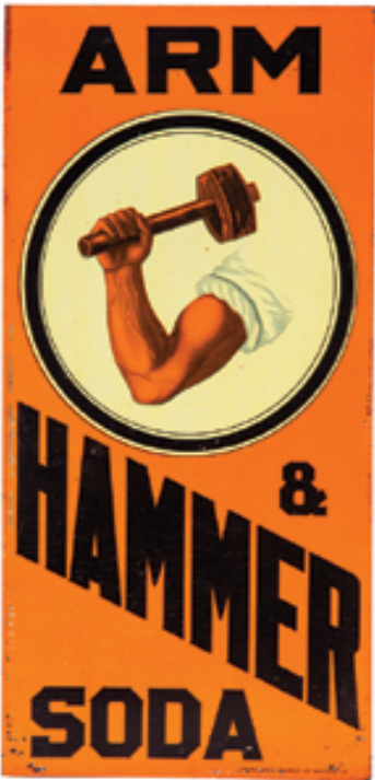
96. Arm & Hammer Sign

13-5/8 x 6-5/8" Very early tin litho baking soda sign featuring early lithography by Kellogg & Bulkeley Co., Hartford, CT. Clean and bright, w/ a great look (displays as a C. 8++) w/ exception of some light wear in outer border area).