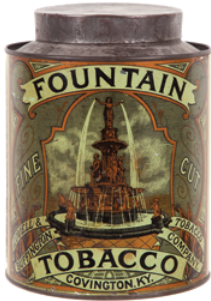
46. Fountain Tobacco Tin 6.5 x 4-7/8" (dia.) Important, very early Lovell & Buffington Co. small top canister. Clean and exceptionally nice, w/ a few minor background chips (a very strong C. 8++). Min. bid $250.