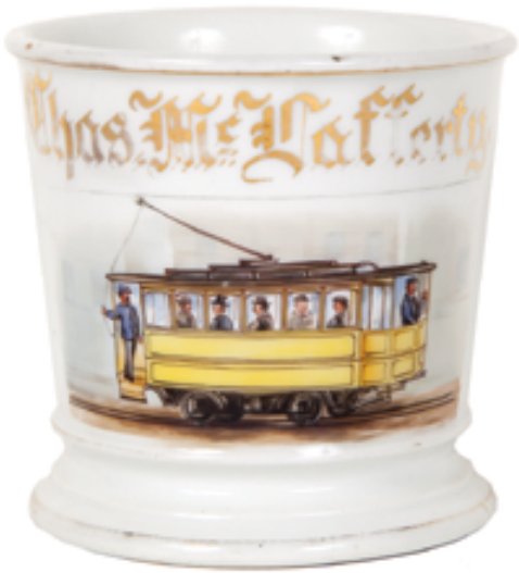
48. Trolley Car Shaving Mug 3-5/8 x 3.75" (dia.) Early, fine china trolley car operator occupational shaving mug featuring beautifully detailed hand-painted image. Excellent.