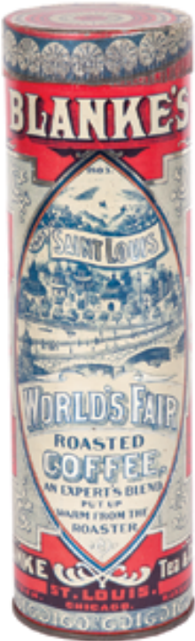
150. Blanke's World's Fair Coffee

11 x 3.25" (dia.) Outstanding early tin litho coffee can w/ finely detailed graphic image of 1903 St. Louis World's Fair. Clean, bright and exceptionally nice (a strong C. 8.5+).