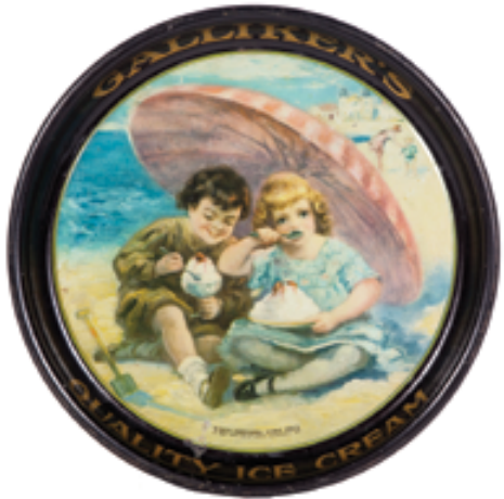
155. Galliker's Ice Cream Tray

13-1/8" (dia) Early tin litho tray. Clean, bright and excellent appearance (displays as a strong C. 8++) w/ minor wear, including small wear spot at 7 o'clock bottom edge.