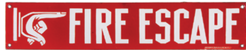
27. Porcelain Fire Escape Sign 4 x 20" Great early enameled porcelain Fire Escape sign w/ raised volcano grommet holes. Clean, bright and excellent. Min. bid $100.