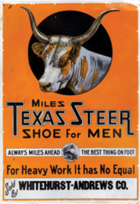
117. Texas Steer Shoes Sign 19-5/8 x 13.75" Outstanding, early embossed tin litho sign for Miles Co.'s "Texas Steer" brand shoes. Appears never used and is clean, bright and very attractive in appearance w/ a few minor bends and a little non-offensive corner and background wear (a strong C. 8/+). Min. bid $150.