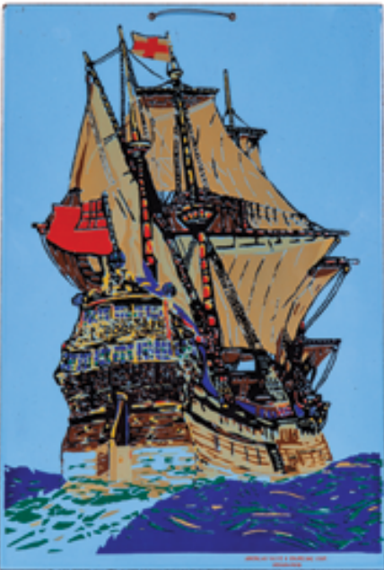
56. Salesman's Sample Sign

14 x 9.5" Fine, early, heavy enameled porcelain multicolor salesman's sample sign made by the American Valve & Enameling Co. (Indianapolis, IN). Crisp, bright and like new (near mint), w/ Co.'s original pennant shaped paper label on backside.