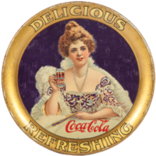
88. 1903 Coca-Cola Tip Tray

4-1/8" (dia.) Scarce tin litho tip tray featuring opera star Hilda Clark. Clean, bright and very attractive (displays a C. 8.5), although close examination will show a couple very minor dents in upper background and some light wear at outer edges of rim.