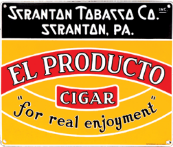
75. Porcelain El Producto Cigars Sign

20 x 24" Early, heavy enameled porcelain cigar store sign by Baltimore Enamel Co. Clean, bright and excellent (a strong C. 8.5/+) w/ minor wear in outer border area and a trace bit of minor, very faint soiling/ speckling in bottom yellow background area.