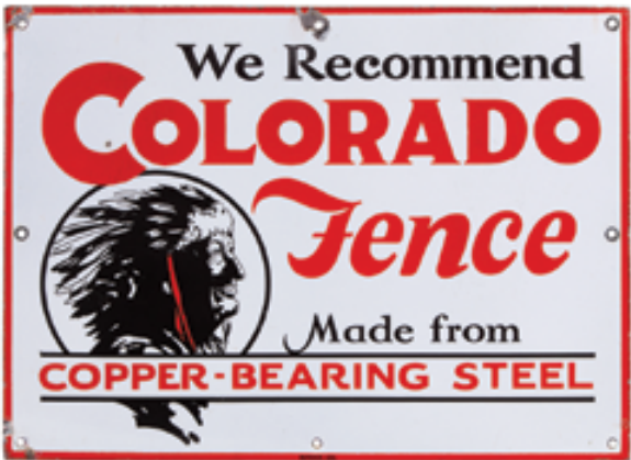
109. Porcelain Colorado Fences Sign

16 x 22" Early, heavy enameled porcelain sign. Clean and bright, w/ a great overall look (displays as a strong C. 8/+); w/ tiny background chip inside letter "C" of Colorado, and a little minor edge wear and some weathered chipping at left corners and area surrounding top middle hanging hole.