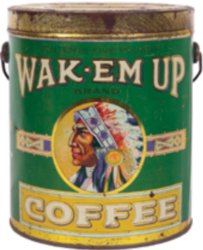
145. Wak-Em-Up Coffee Pail

9 x 7.5" (dia.) Large, early 5 lb. tin litho coffee pail for "Wak-Em Up" brand (same nice image both sides). Clean, bright and very attractive (displays as a strong C. 8+), w/ a little non-offensive minor scattered wear (critical grade C. 8+/-), w/ scattered darkening areas on gold flash surface of lid.