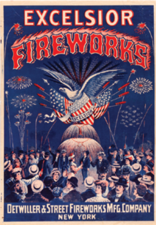
97. Excelsior Fireworks Poster

31.25 x 21-7/8" Powerful and impressive, large, very early paper litho poster for Detwiller & Street Fireworks Co., New York, w/ beautiful graphics. Clean, bright and very nice appearance, w/ only minor wear (C. 8.5/+).