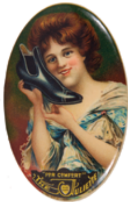
28. Juliette Shoes Pocket Mirror 2.75 x 1.75" Scarce, early celluloid pocket mirror advertising Juliette brand shoes, w/ beautiful multicolor graphics. Clean, bright and excellent. Min. bid $100.