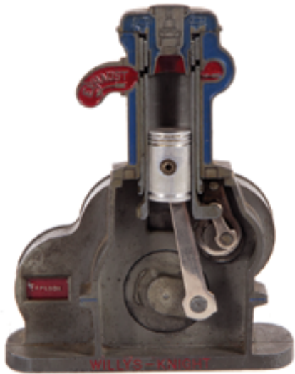
17. Willys-Knight Salesman's Sample 4.25 x 3.25 x 1.75" Early Willys-Knight Automotive Co. working salesman's sample featuring miniature version of metal engine compression chamber (knob on backside turns piston up and down while at same time moving a descriptive red panel dial). High quality piece, w/ nice detailing. Excellent. Min. bid $100.