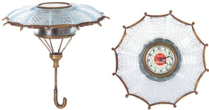
57. Coca-Cola Umbrella Clock

7 x 7.25" (dia.) Very early figural advertising clock for Coca-Cola. Has a beautifully embossed, heavy pressed glass body, w/ finely detailed china dial, brass umbrella handle and clock case closure on back. Extremely rare, museum quality piece is excellent and all original (clock mechanism not running).