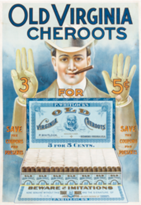
112. Virginia Cheroots Cigar Sign 29.25 x 20" Very early paper litho linen backed poster. Clean, bright and very attractive (displays as a strong C. 8.5/+) w/ a little minor, very well done professional background touch up. Min. bid $100.