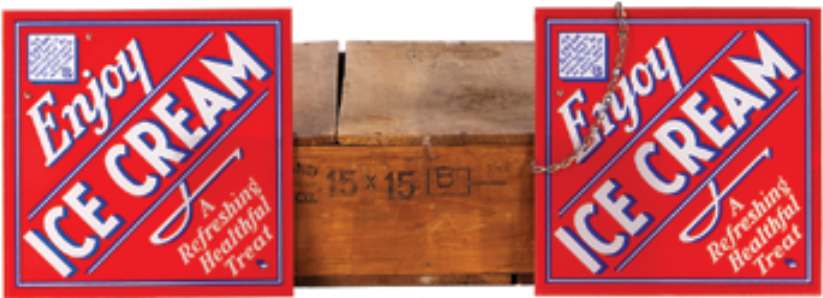
154. Glass Ice Cream Signs

14-1/8 x 14-1/8" ea. (crate 5.5 x 17 x 18"). Two early reverse glass chain hung ice cream parlor signs w/ fired on finishes on backs. Crisp and like new, as found in original shipping crate (note: one has a non-detracting faint slivered chip at top edge).