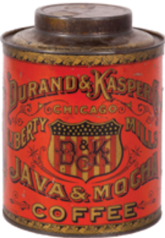
134. Liberty Mills Coffee Can

7-1/8 x 5.5" (dia.) Early tin litho small-top coffee can (Durand & Kasper Co., Chicago, IL) w/ great patriotic Miss. Liberty images on sides. Clean, bright and very attractive (a strong C. 8/+), w/ minor crazing and wear.