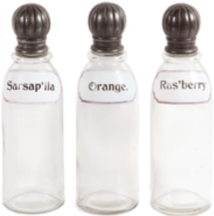
151. Fancy Soda Fountain Syrup Bottles

12.75 x 3-3/8" (dia.) Fancy high quality glass syrup display bottles w/ hand-applied necks, beautifully enameled porcelain labels & fancy figural metal caps. Excellent.