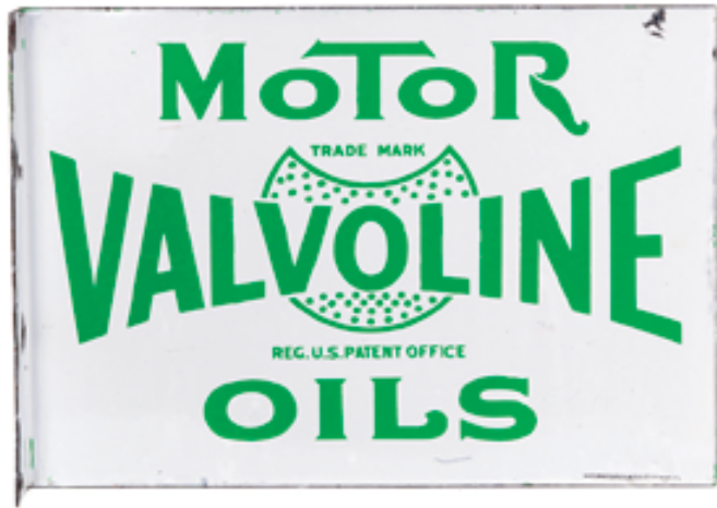
95. Valvoline Motor Oil Sign

14 x 20-1/8" Early, 2-sided heavy enameled porcelain flange sign. Clean, bright and very attractive, w/ nice original sheen (displays as a strong C. 8++) w/ a little light scattered background wear and some chipping along angled flange mounting section.