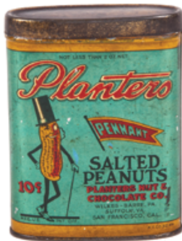
29. Planters Pocket Tin 3.5 x 2-5/8 x 7/8" Scarce, early tin litho pocket tin for Planters salted peanuts. A clean, bright, very nice example, that displays well (as a strong C. 8+), w/ a little minor soiling, a couple tiny dents and a little non-detracting minor scattered background wear. Min. bid $100.