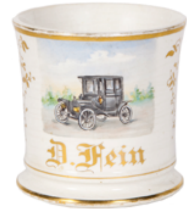
72. Auto Shaving Mug

3.5 x 3.25" (dia.) Nice, early fine china shaving mug featuring beautifully detailed hand-painted im- age of early Model T car. Excellent, w/ just a trace hint of minor crazing.