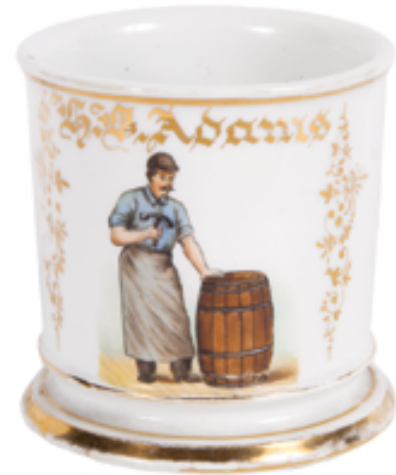
25. Barrel Maker Shaving Mug 3-5/8 x 3-5/8" (dia.) Early fine china occupational shaving mug w/ beautifully detailed hand-painted image. Excellent, w/ minor wear to the decorative gold trim at base. Min. bid $100.