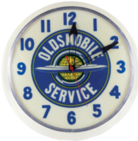
120. Oldsmobile Clock 5 x 16.25" (dia.) Scarce, light-up metal, plastic and glass clock from early auto dealership. Excellent (C. 8.5++). Lights up and runs nicely. Min. bid $100.