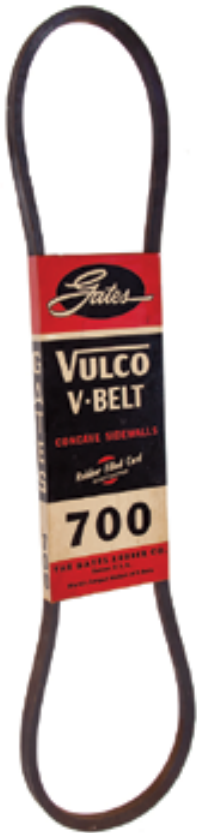
59. Giant Gates Motor Belts Trade Sign

57 x 11.5 x 1.25" Outstanding, giant oversized figural service station trade sign, which is an exact likeness of Co.'s actual packaging. Belt is a heavy rubber composition material, advertising section is lithographed tin. Clean, bright and very attractive, w/ minor soiling (C. 8/+). As found, should improve w/ cleaning.