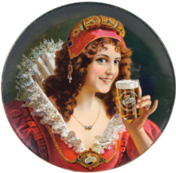
66. Lemp Brewing Co. Sign

16" (dia.) Beautiful, early tin litho concave small charger style sign for Lemp Bewing Co., (St. Louis, MO.) Clean, bright and excellent (basically a C. 8.5/+) w/ a little non-offensive minor denting and light wear at outer edges.