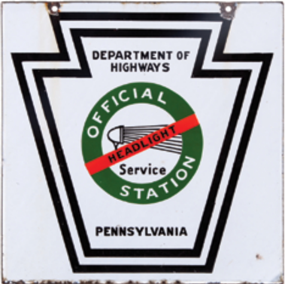
143. Headlight Service Porcelain Sign

17-7/8 x 17-7/8" Early, 2-sided heavy enameled porcelain. Clean, bright & attractive appearance w/ nice sheen (displays as a strong C. 8+); w/ some early weathered chipping at top mounting holes, a little light chipping along bottom edge & a few non-offensive stone chips in white background area.