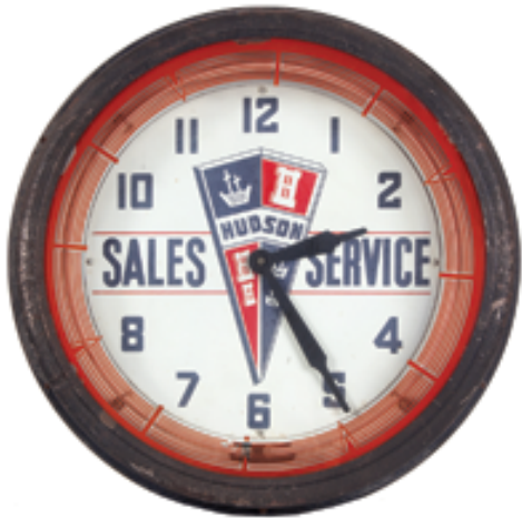
44. Hudson Autos Neon Light-up Clock 7 x 20" (dia.) All original, vintage neon car dealership clock. Clean and very attractive, w/ just the right amount of light wear (C. 8/+). Note: we have not plugged it in, as cord on back is heavily frayed and needs replacing.