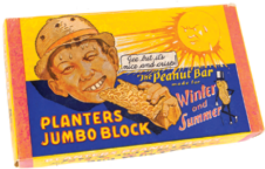
22. Planters Jumbo Block Box 7 x 12 x 2" Rare, ca. 1930's, 2-ps. waxy cardboard display box. Has a slight bit of mellowing and some non-detracting minor haziness on lid and a tear mark in one of side apron edges, but overall clean and impressive (C. 8+/-). No die-cut inside. Min. bid $100.