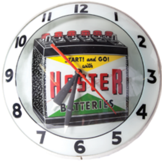
101. Hester Batteries Clock

4 x 15.5" (dia.) Early, working electric light-up Double-Bubble style advertising clock, w/ original Advertising Products Co. label on backside. Clean and excellent.