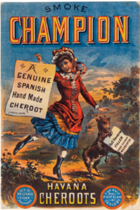
91. Champion Cigars Sign

22-1/8 x 15-3/8" (20.5 x 13.5" actual sign) Fine, very high quality, early stone litho sign for Champion brand cigars, featuring beautiful multicolor lithography by Heffron & Phelps Co. NY. Printed on a fine cloth material, it is clean, bright and like new. Professionally matted and ready to frame.