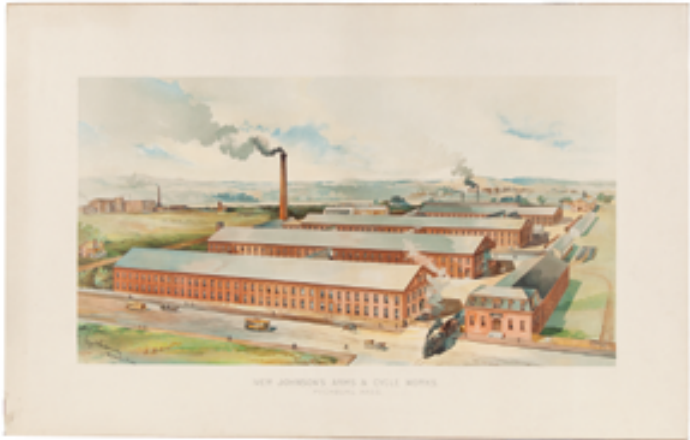
106. Iver Johnson Ammo Co. Sign

24 x 38" (16 x 30" image) Large, very early Iver Johnson Arms & Cycle Works Co., paper litho sign featuring Co.'s early Fitchburg, MA factory. Clean and very attractive appearance (displays as a strong C. 8.5/+), w/ some minor wrinkling and toning/soiling in outer white border area.