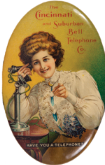
62. Cincinnati Telephone Pocket Mirror

2.75 x 1.75" Outstanding, extremely rare, early celluloid advertising pocket mirror from Cincinnati & Suburban Bell Telephone Co. Excellent.