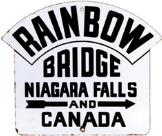
115. Porcelain Niagara Falls Sign 17-7/8 x 21.25" Early heavy enameled porcelain Rainbow Bridge sign, Niagara Falls boarder crossing. Displays nicely (a strong C. 8/+ ) w/ a little non-offensive oxidized weathering at outer edges and mounting bracket holes. As found, should improve w/ cleaning. Min. bid $100.