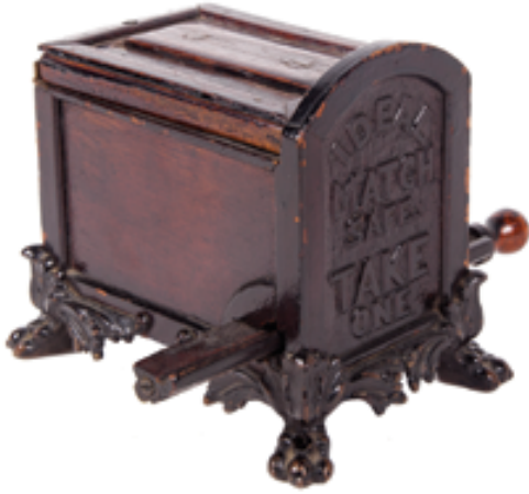
105. Mechanical Match Dispenser

5.25 x 4.25 x 6" Fine, very early figural wooden countertop mechanical match dispenser w/ cast iron feet and trim, embossed: "Ideal Match Safe, Take One" on front. Excellent and all original, w/ a nice, rich surface patina (a strong C. 8++).