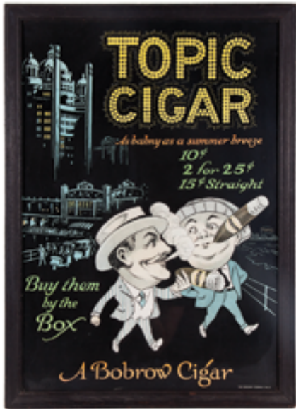
92. Topic Cigars Sign

34-3/8 x 24.25" (31.5 x 21.5" visible) Large, early paper litho sign in its original frame, featuring great ca. 1920's Atlantic City Boardwalk theme. Clean and very attractive appearance (C. 8/+), w/ a little well done minor touchup at very outer right edge.